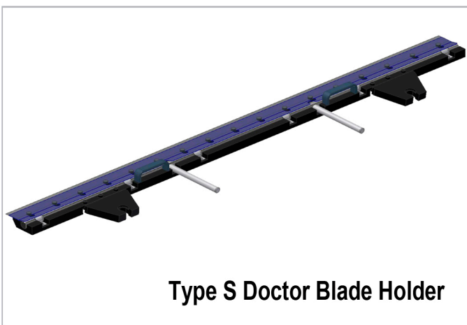
Type S Doctor Blade Holder

To be highly successful in business, you need the proper tools to ensure superior quality and productivity. Gravure and flexographic printing methods demand high precision equipment from prepress to postpress. Having the right tools to produce quality products and to reduce press downtime is crucial. Even micron-sized deviations have a measurable influence on print quality.